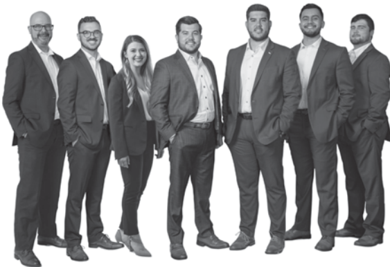
Garcia Wealth Management is a proud supporter of the Conway Symphony Orchestra

FINANCIAL PLANNING MEANS SOMETHING DIFFERENT TO EVERYONE.