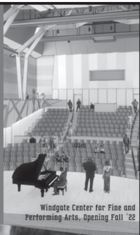
Windgate Center for Fine and Performing Arts, Opening Fall '22