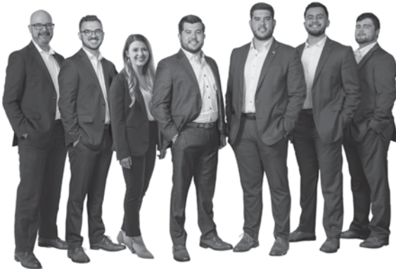
Garcia Wealth Management is a proud supporter of the Conway Symphony Orchestra

FINANCIAL PLANNING MEANS SOMETHING DIFFERENT TO EVERYONE. LET OUR TEAM UNCOVER WHAT IT MEANS TO YOU.